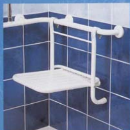
Art. SDA Handrail hanging folding seat.