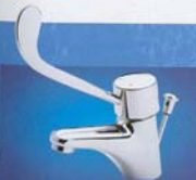
Art. 710 Wash basin mixer with clinical lever.