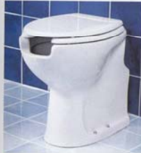
Art. 420 Backed clay WC - bidet with front opening and wall or floor drainage. The package contains the technical bend for the floor drainage.