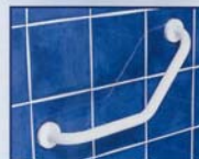
Art. 110 45° angle hand bar.