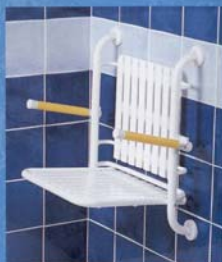
Art. SSB Folding seat for the shower with back and arms.