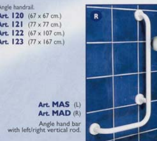
Art. MAS (L) Art. MAD (R) Angle hand bar with left/right vertical rod.