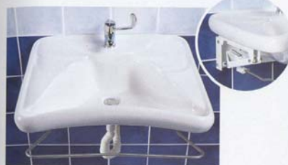
Art. 410 Backed clay washbasin, splash shield height, front concave border and elbowrest. It has a reclining mechanism which can be moved by a front control bar. Maximum inclination: 30 cm.