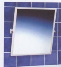
Art. 350N Adjustable tilting mirror.