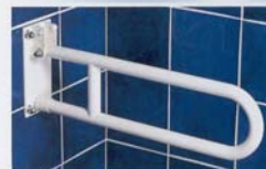
Folding supporting bar. Art. 600 (60 cm.) Art. 830 (83 cm.)