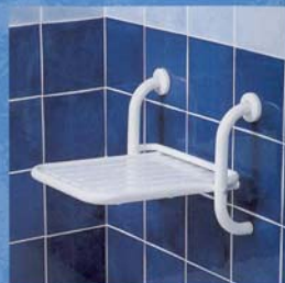
Art. SRD Folding seat for the shower.