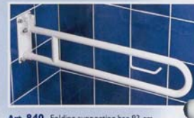
Art. 840 Folding supporting bar 83 cm. with roll holder.