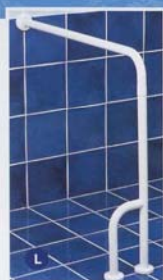
Art. 800 Wall-to-floor supporting bar 78 x 80 cm.