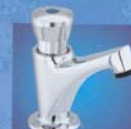
Art. 910 Wash basin tap.