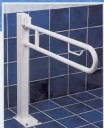
Art. 860 Folding supporting bar 83 cm. on post with or without roll holder.