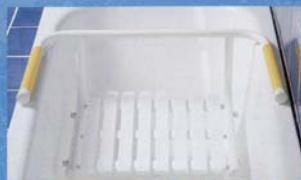
Art. SV Stainless steel seat for standard bathtubs 70 cm.